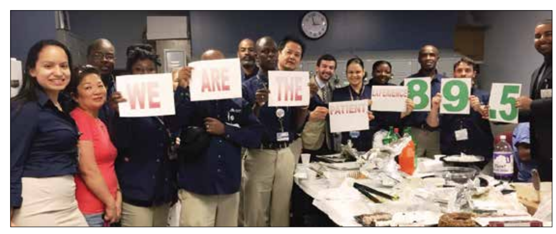
The Mount Sinai West Transport Team

On June 14, the Mount Sinai West Patient Transport team gathered to celebrate recent groundbreaking success in their patient experience outcomes. After months of stagnant patient experience scores, the team set their sights on a significant goal—to reach a mean score of 89.5 percent for the inpatient survey question, "Rate the person who transported you around the hospital."