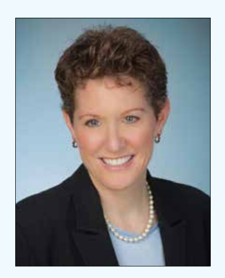
I appreciate all you do, every day, to make Mount Sinai the best place for patient care.

This edition of the Patient Experience Newsletter is once again filled with outstanding and heartwarming examples of how employees across the Mount Sinai Health System are caring for patients with compassion, empathy, and creativity. I am grateful to all of you who make it your mission to provide the best experience possible for our patients.